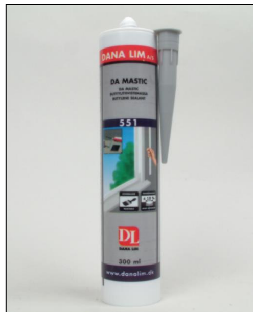
Damastic 551 is an oil based plastic sealant, which forms an elastic skin on approx. 1 mm, and remains soft and plastic below the skin. The sealant can be painted, and is easy to work.

Damastic 551 bonds too most ordinary used building materials. The sealant can't withstand constant water affect, and has limited resistance towards direct UV-light and high temperature.